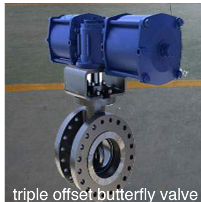
triple offset butterfly valve