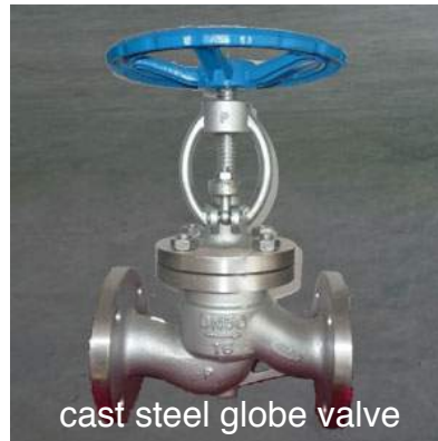
cast steel globe valve