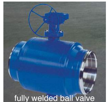
fully welded ball valve