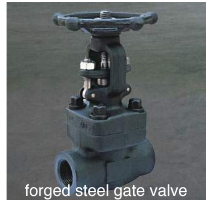
forged steel gate valve