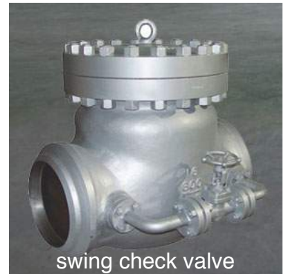
swing check valve