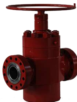
FC gate valve