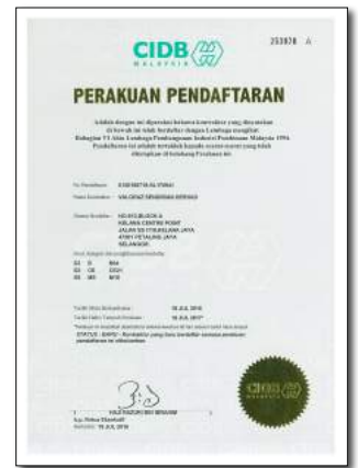
LEMBAGA PEMBANGUNAN INDUSTRI PEMBINAAN - CIDB