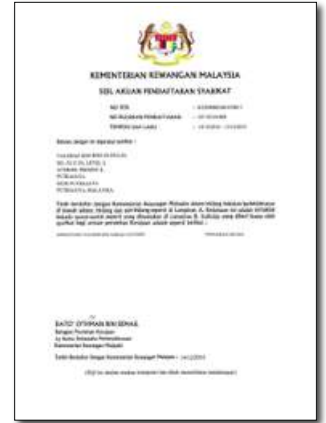
MINISTRY OF FINANCE